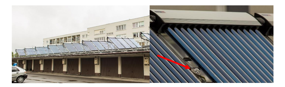
Fig. 1. Installation – left side, pyranometer mounted between pipes – right side